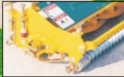
Optional Floating Mowing Head for Low Mowing Heights and Fairway Mowers