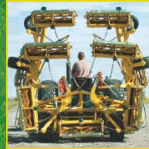
11 gang transportable mode