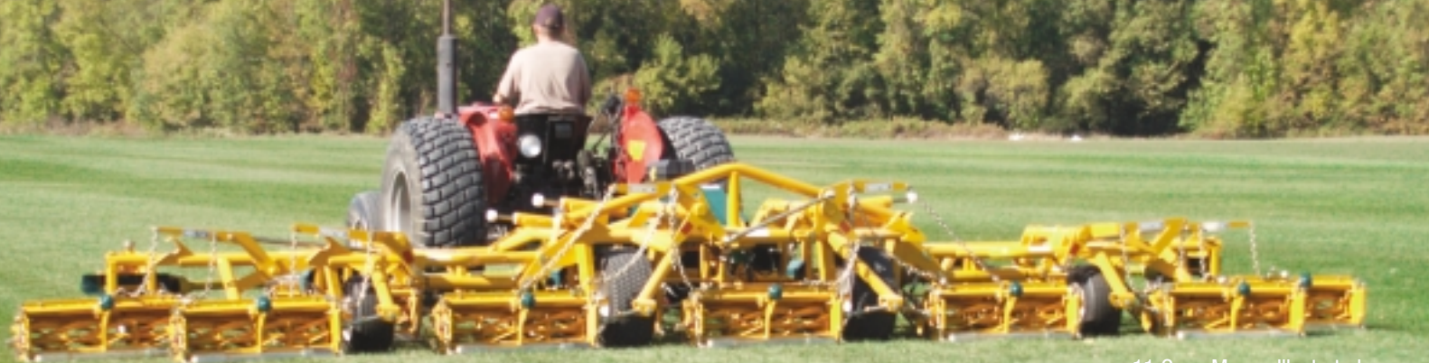
11 Gang Mower Illustrated