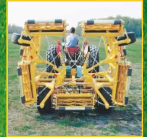
9 gang transportable mode