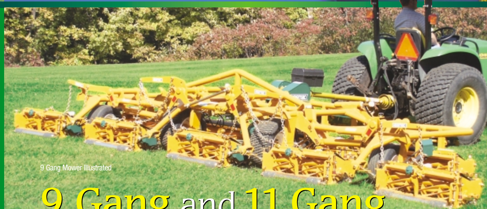
9 Gang Mower Illustrated