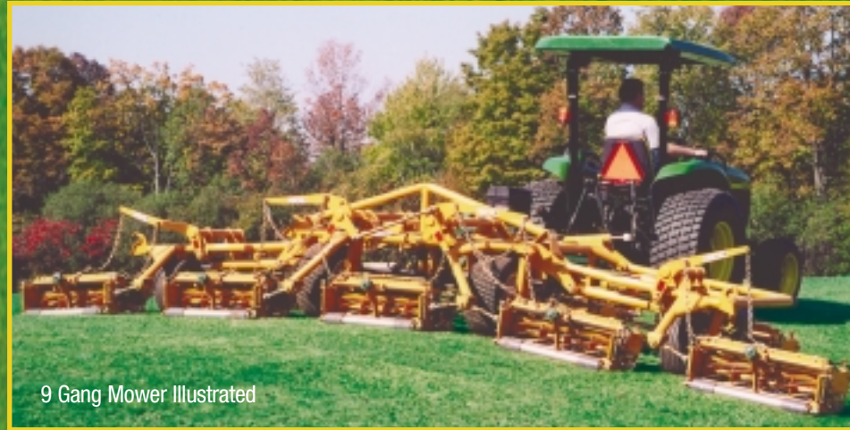
9 Gang Mower Illustrated